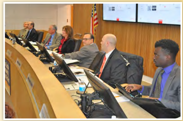
The Governing Board reaffirmed their support for students and staff after nearly 800 people signed a petition demanding a response to post-election fears.

Held in Diablo Valley College's Performing Arts Center, an audience of students, staff, faculty, and community members listened as the Board expressed their commitment to maintaining a safe and secure environment